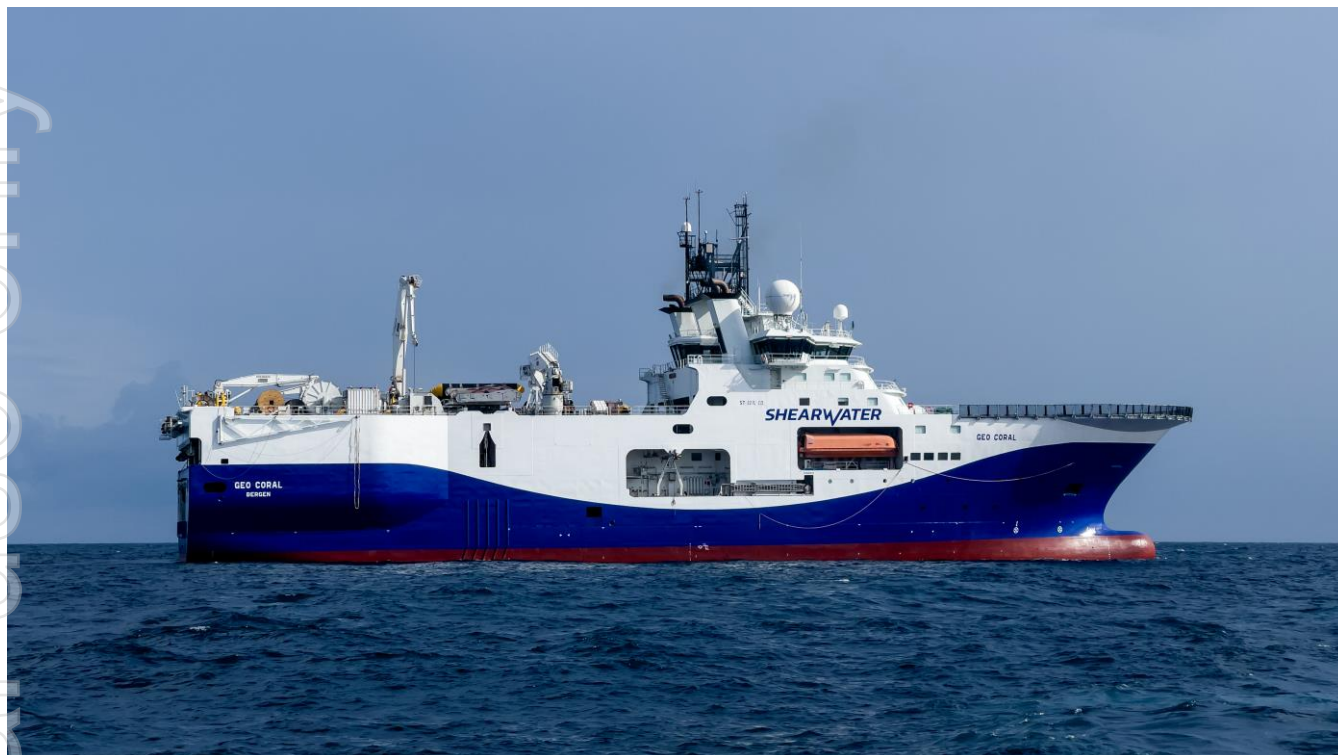
Figure 2: Shearwater's Geo Coral vessel will be undertaking the seismic acquisition